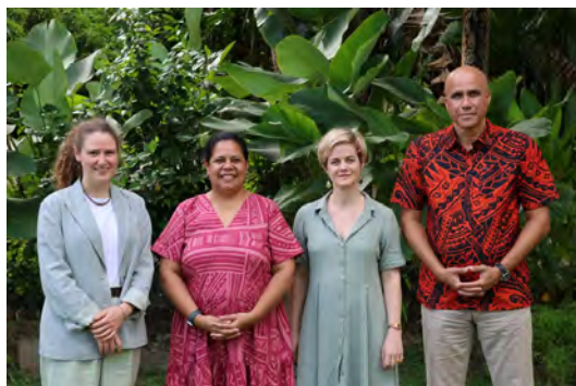
Secretariat of the Pacific Community