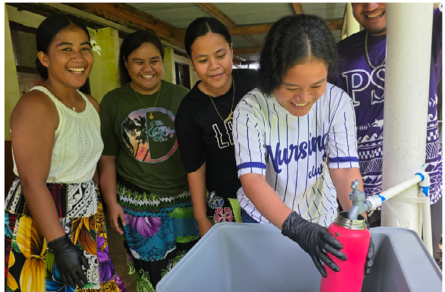
Students from Rohi Elementary School enjoy clean drinking water straight from the faucet.

Today's training is an important first step in helping students understand how to test and monitor their own water supply. Once the drinking stations are operational, the students themselves will help test whether the filtration systems are effectively making the water safe for drinking. Through this approach, students are not only beneficiaries of the project but also active participants in protecting the health of their school community.