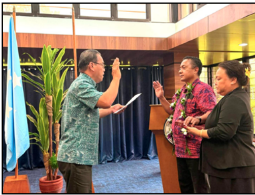
FSM Information Services